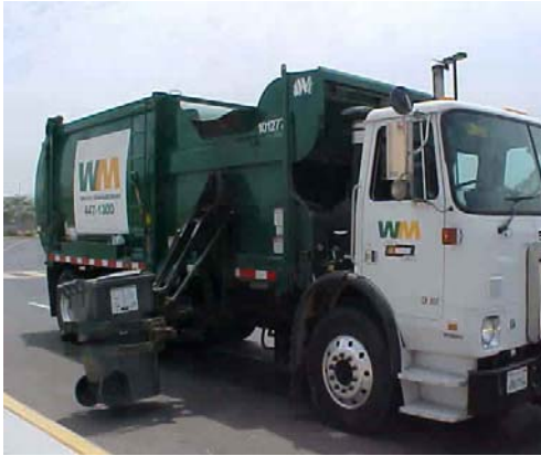
Vehicles such as this one securely transport confidential materials to the point of destruction